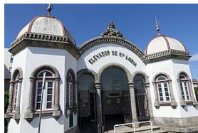
Santa Luzia funicular