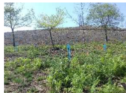
Riba de Âncora forest