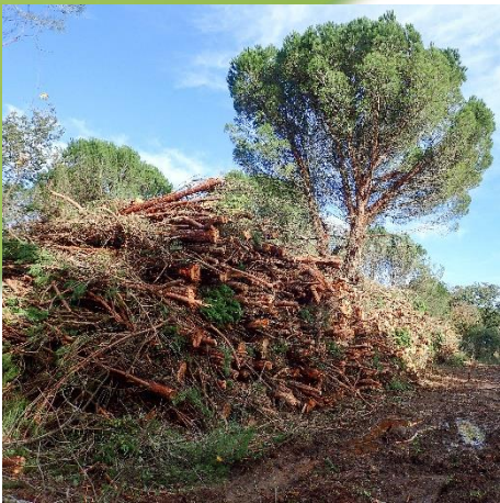
Quentin Vanneste - CRPF PACA © CNPF

FG #20: Forest biomass : Sustainable mobilisation of forest biomass