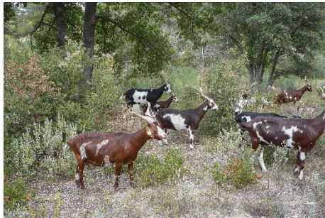
François Galley © CNPF

FG #22: Agroforestry: introducing woody vegetation into specialised crop and livestock systems